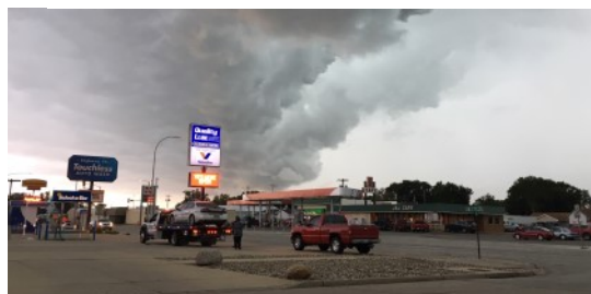
The Truck Stop looking from the corner of 3rd Street SW and 5th Avenue SW.